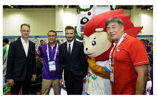
David Beckham pays a surprise visit to athletes at the APG Official Games Village.

Over 2,500 officials and athletes from the region painted the town red as Singapore hosted the 8th ASEAN Para Games (APG) for the first time in history. As the Official Games Village for the biennial event, Marina Bay Sands demonstrated the versatility of its facilities, by ensuring every touch point of the Games journey was well-equipped and accessible for the athletes.